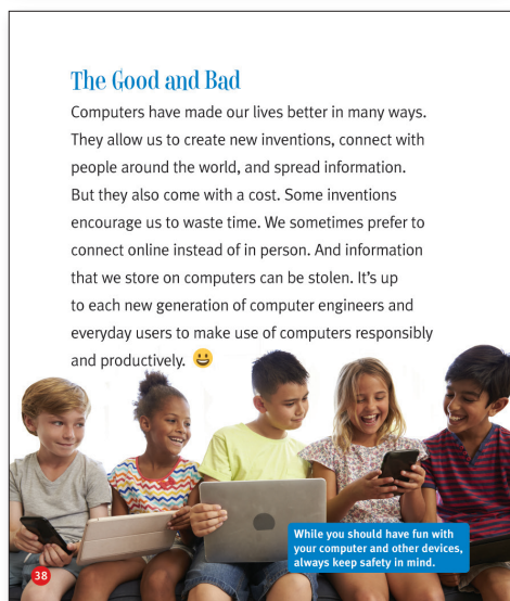
Sample spread from Think Like a Computer